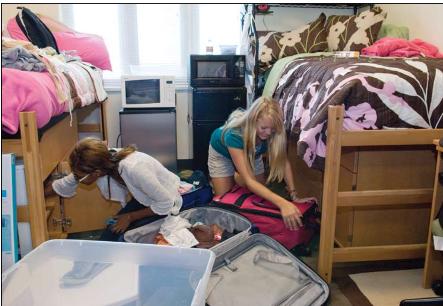
Move-in day: a timeless tradition.